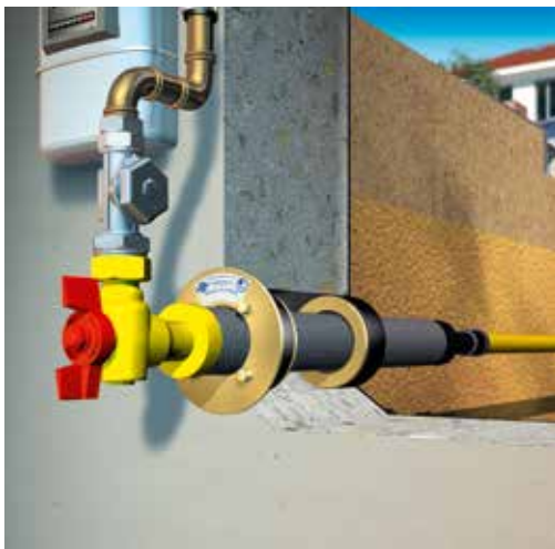
Quadro-Sicura® E-S installation situation