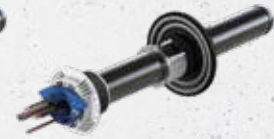
For X-fibre optic cables