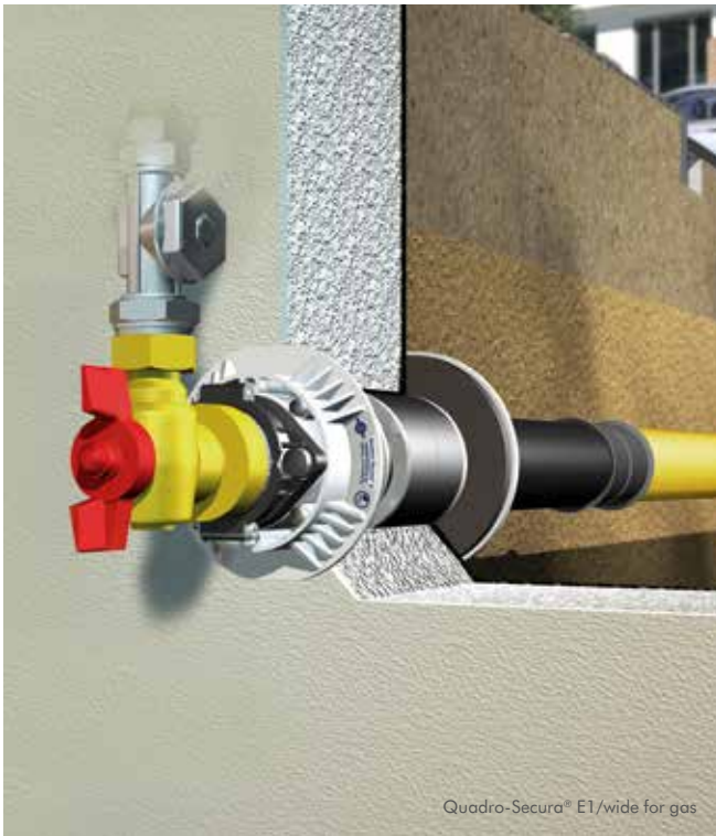
Quadro-Sicura® E1/wide for gas