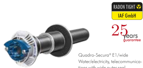
Quadro-Sicura® E1/wide Water/electricity, telecommunica- tions with wide outer seal