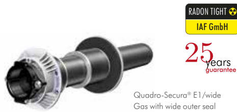
Quadro-Sicura® E1/wide Gas with wide outer seal