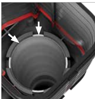
Visual confirmation: top edge of casing clearly and visibly snaps into the holder (arrows)