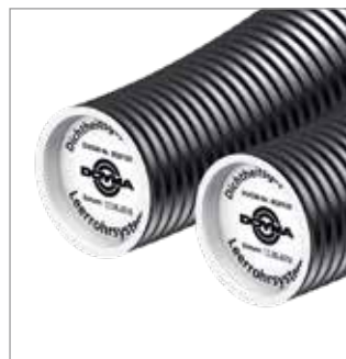
Pipe sleeve pressure-tested at the plant – now with nominal/outer diameter 90 (inner diameter 78)