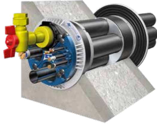
Quadro-Sicura® Nova 1/wide With wide outer seal