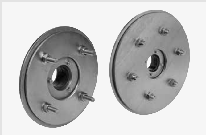
HKD DOMO-NW-Z / HKD DOMO-DW-Z