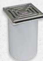
Extension of stacking frame