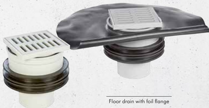
Floor drain with foil flange