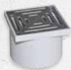
Stainless steel grating, screwed in