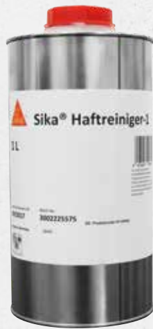
Sika adhesive cleaner-1 (1754)