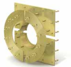
Variant: Curaflex® 7005/T pipe sleeve – split version, for installation with an existing pipe.