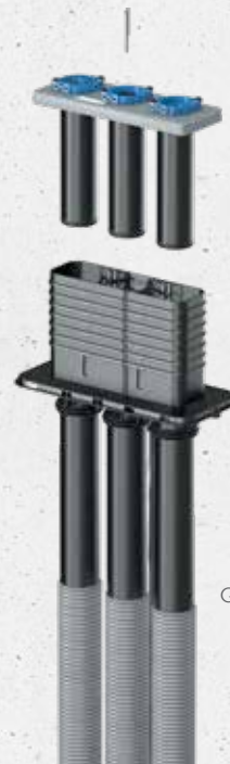
Quadro-Sicura® Nova R3