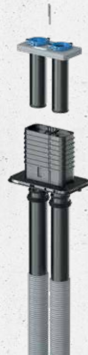
Quadro-Sicura® Nova R2