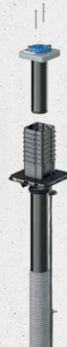
Quadro-Sicura® Nova R1