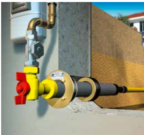
Quadro-Sicura® E-S installation situation