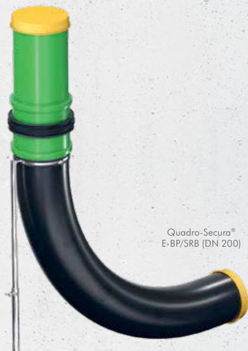
Quadro-Sicura® E-BP/SRB (DN 200)