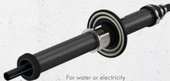
For water or electricity