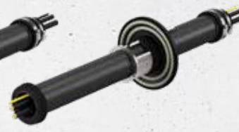
For fibre optic cables