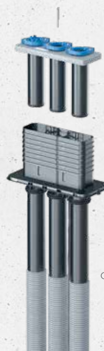
Quadro-Sicura® Nova R3