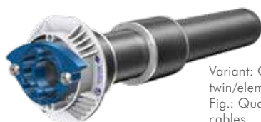
Variant: Quadro-Sicura® E2/breit for twin/element walls (180–550 mm) Fig.: Quadro-Sicura® E2/breit for fibre optic cables

Prices do not include fixtures and pipes/cables.