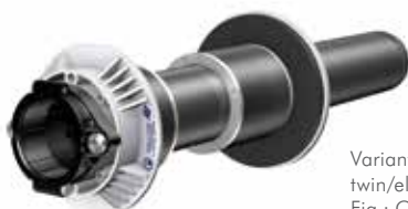
Variant: Quadro-Sicura® E1/breit for twin/element walls (160–550 mm) Fig.: Quadro-Sicura® E1/breit for gas

Prices do not include fixtures and pipes/cables.