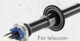
For telecom- munications