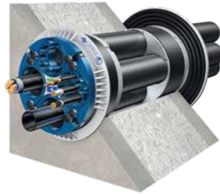
Quadro-Secura® Nova 1/breit With breit outer seal