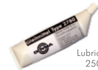
Lubricant (2780) 250 ml tube