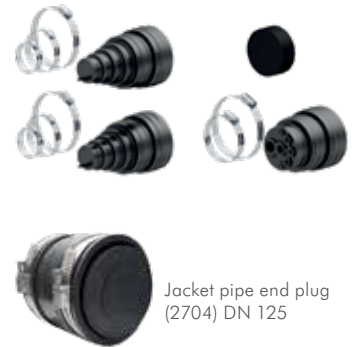
Jacket pipe end plug (2704) DN 125