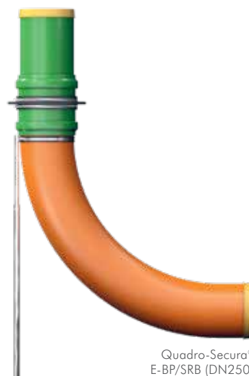
Quadro-Sicura® E-BP/SRB (DN250)