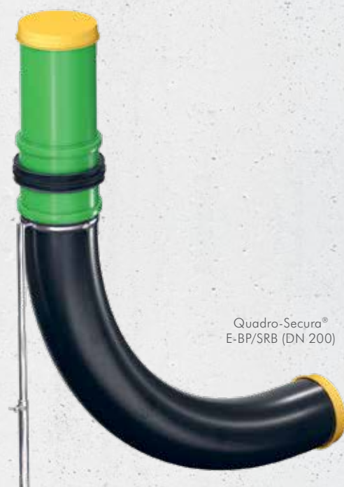
Quadro-Sicura® E-BP/SRB (DN 200)