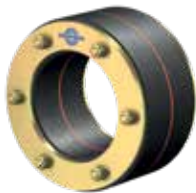
Curaflex Nova® C40/SRB

Additional information about our Curaflex® sealing systems can be found in the applicable product documentation.