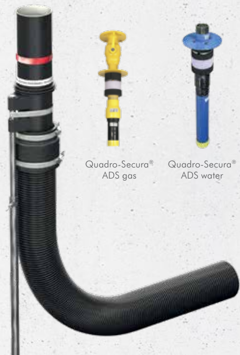
Quadro-Sicura® ADS gas