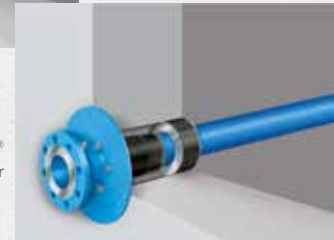
Quadro-Sicura® ADS water