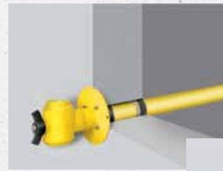
Quadro-Sicura® ADS gas