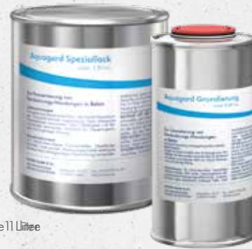
Diehtregryösize 11 Litree