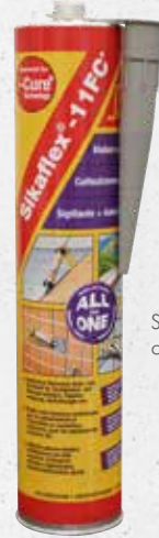
Sikaflex-11FC sealing compound (1756)