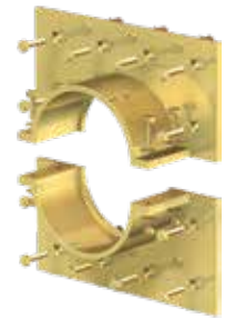
Variant: Curaflex® 8000/T pipe sleeve – split pipe sleeve. For installation with an existing duct.