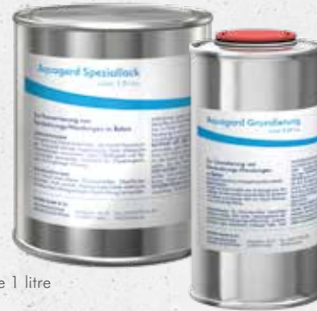
Delivery size 1 litre