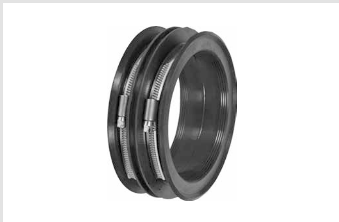
HKD wall collar