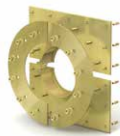
Variant: Curaflex® 7005/T pipe sleeve – split version, for installation with an existing duct.