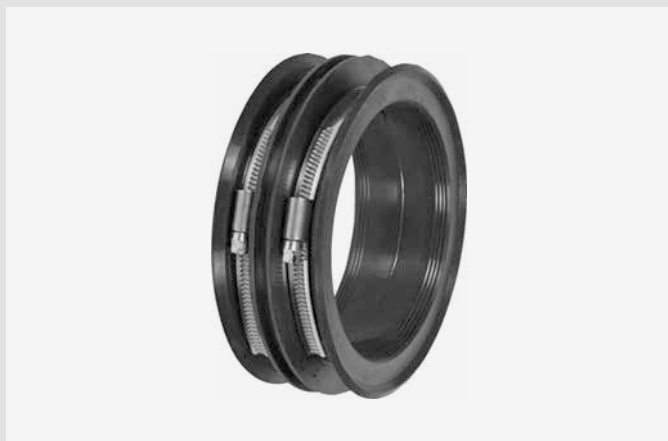
HKD wall collar