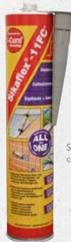
Sikaflex-11FC+ sealing compound (1756)