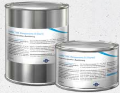
2-component epoxy resin coating