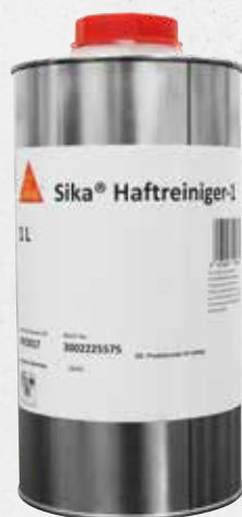
Sika adhesive cleaner-1 (1754)